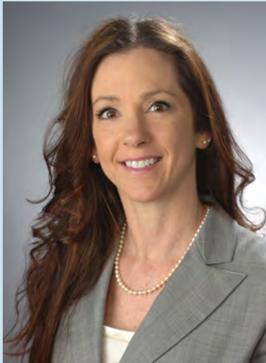
Chair Elect (1-year term begins in 2020)